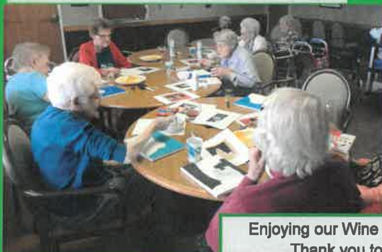
Enjoying our Wine & Canvas afternoon! Thank you to all our artists!!