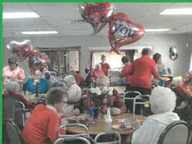
Our residents enjoying our Valentine's Day Party & decorating cookies for all to enjoy!!