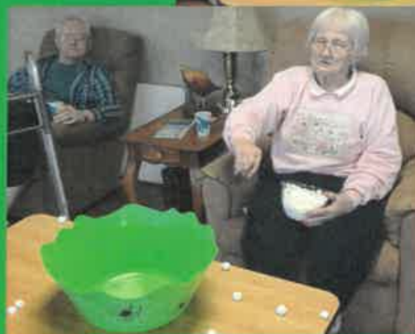
Playing Minute To Win it games to pass the winter away!!