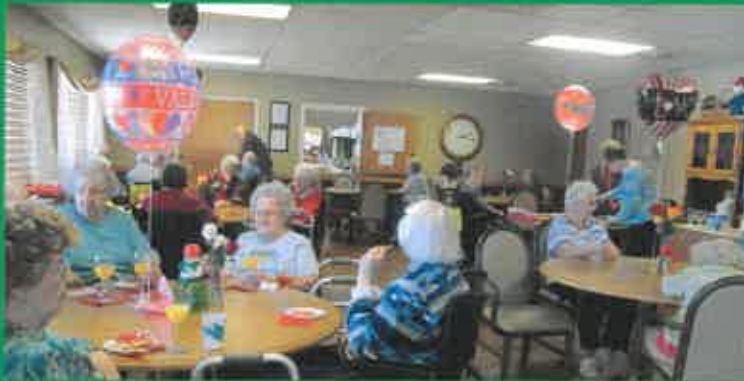
Our residents enjoying our Valentine's Day Party !! Thanks to our Key Ladies for helping to serve!!